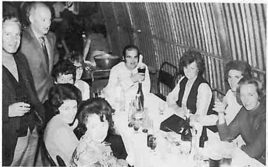
SOME OF OUR GUESTS FROM DUMFRIES COUNTY COUNCIL