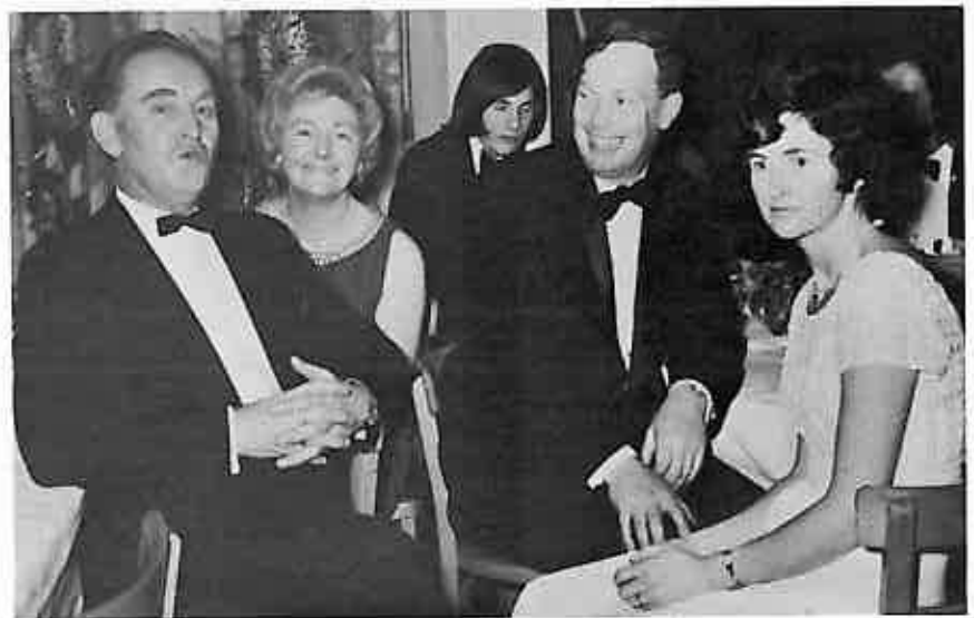
WHO'S SELLING WHO?