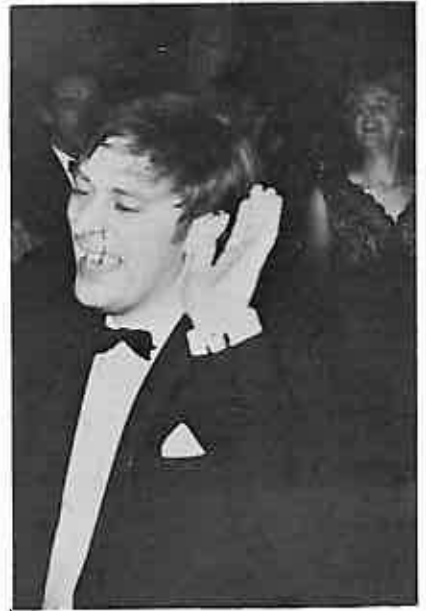
DO YOUR THING!