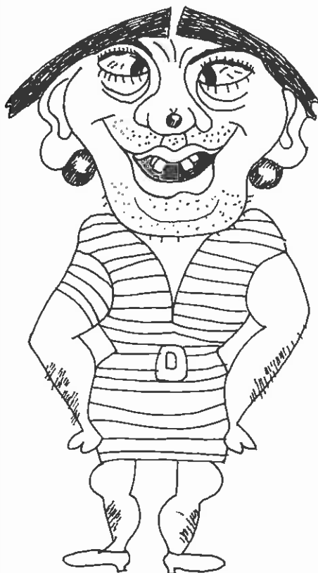
The "Team" pin-up