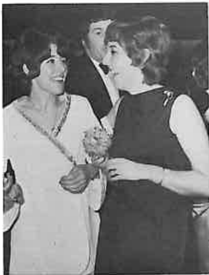
THE TWO OF US!