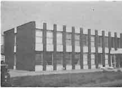
Right Pendower School for Newcastle City (competitive)