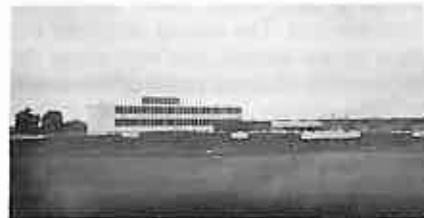
Left Billingham School for Teesside, C.B.C. (competitive)