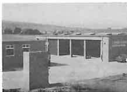
Left Offices & Workshops for F. Short & Sons at Felling. (competitive)