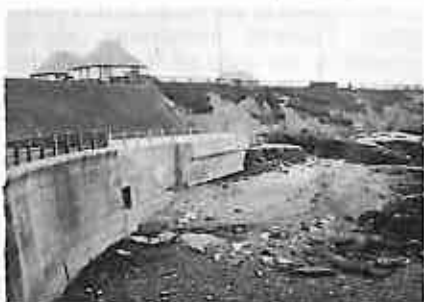
Right Sea Defences for Whitley Bay C.B.C. (competitive)