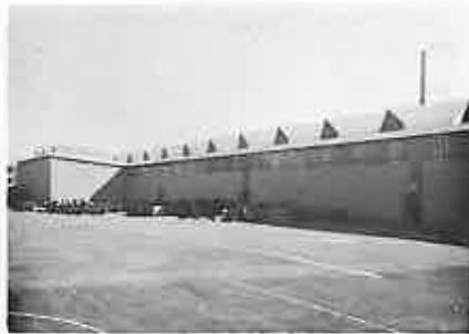
Left Offices and Workshops for S.L.D. Pumps at Birtley. (negotiated)